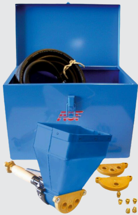
P381 / P391

Intonacatrice + 10mt tubo + scatola + kit lavoro