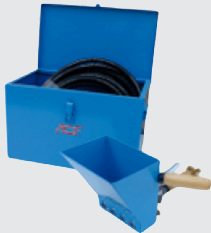
P471 / P491